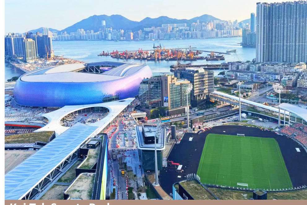
<u>Kai Tak Sports Park</u> ain Stadium and other sports and commercial facilities

With the world class infrastructures and facilities, Kowloon East is well positioned to host more international sports and entertainment mega events, thereby enhancing its attractiveness to visitors worldwide and boosting the local economy across various industries, including sports, tourism, entertainment, hospitality, retail and catering.